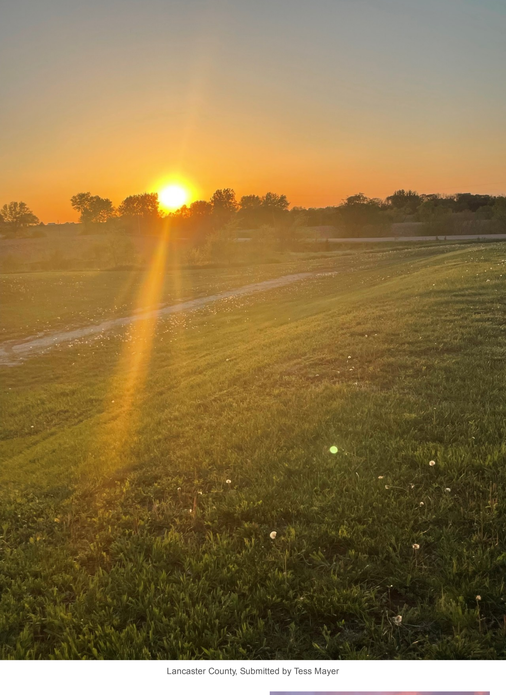
Lancaster County