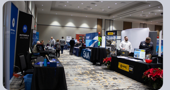
EXHIBIT HALL HOURS