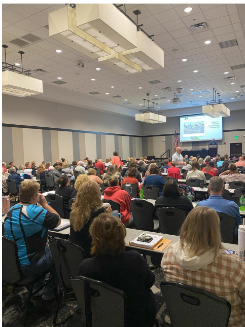
The Nebraska Association of County Assessors Workshop took place in Kearney this