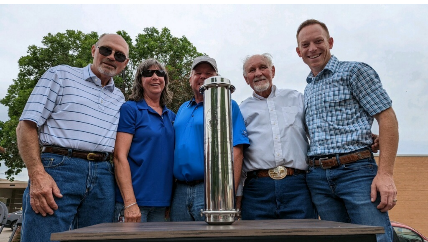
The Lincoln County Board and the time capsule that was buried at the celebration.