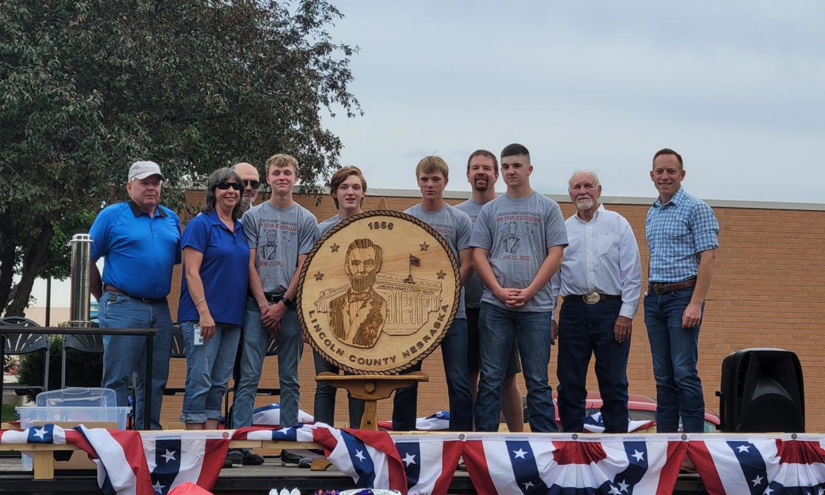
The Lincoln County Courthouse celebrated 100 years with a celebration in North Platte.