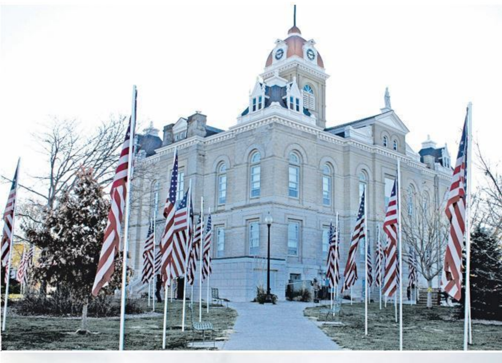
Jefferson County, Submitted by Donald Cook