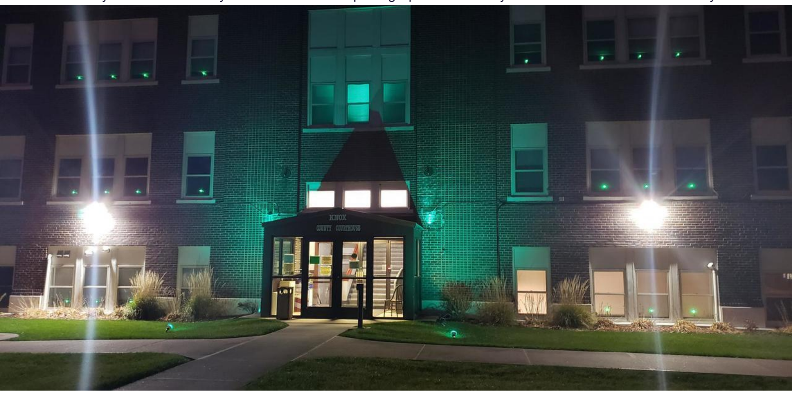
Knox County Courthouse

Every issue of the Ninety-Three will feature a photograph submitted by one of our readers of their county.