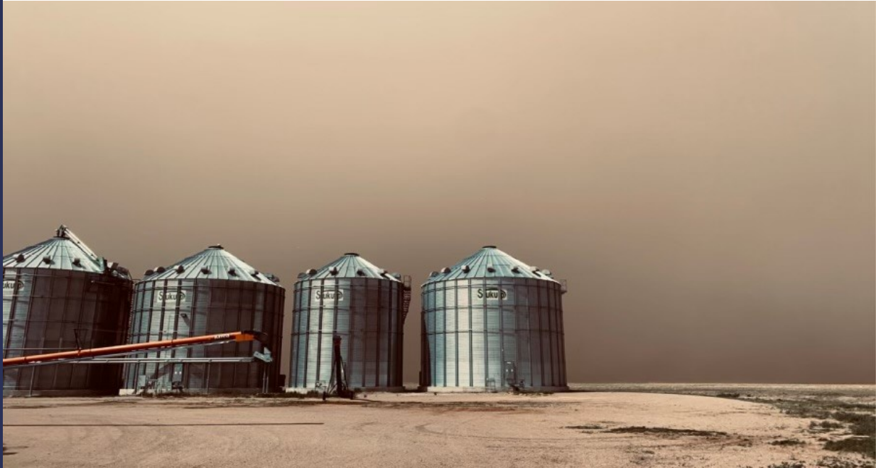
Wheeler County

Click Here to Submit a Photo of Your County