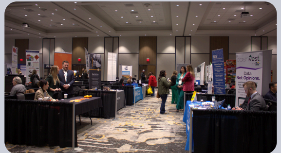
EXHIBIT HALL HOURS